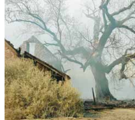
Tamarisk fire destroys pioneer home and cottonwood tree behind Pineview Estates in Washington Fields.