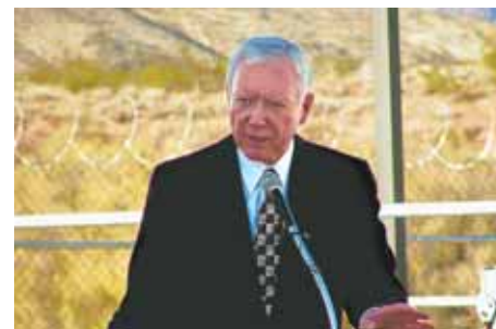
Senator Orrin Hatch

District, thanked all those involved in the project. He said that our state is blessed with great leaders. Water projects in Washington County would not occur if not for the hard work of our delegation in general and Senator Orrin Hatch in particular. Senator Hatch has always shown a special love for and a commitment to the people of southern Utah.