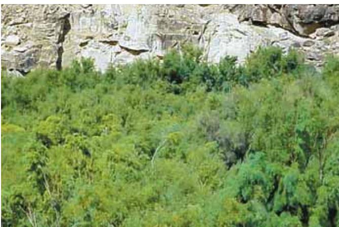
Tamarisk infestation along the Virgin River

This past summer, four Saturdays have found dedicated hunters engaged in tamarisk removal. The Dedicated Hunter Program was established in 1995. It provides sportsmen with various opportunities to involve themselves with conservation projects. Upon completion of program requirements, these hunters are then allowed to hunt in an area of their choice. The hunters have worked in conjunction with the Division of Wildlife Resources and the Virgin River Program on this removal project.