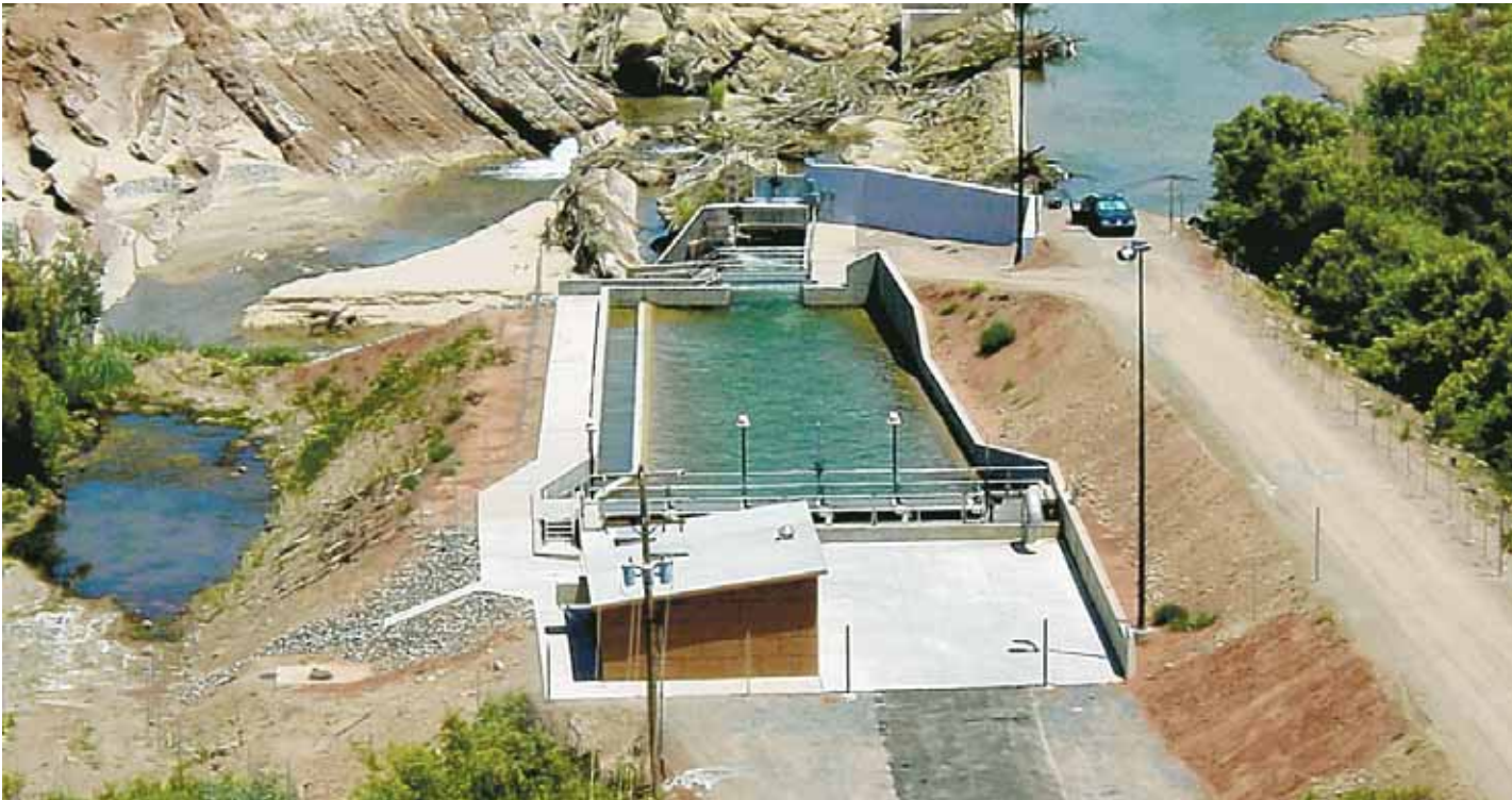
Overview of Diversion Dam and Fish Screens

On Saturday, November 16th, local, state and federal leaders gathered to dedicate the Washington Fields Diversion and Fish Screen structure.