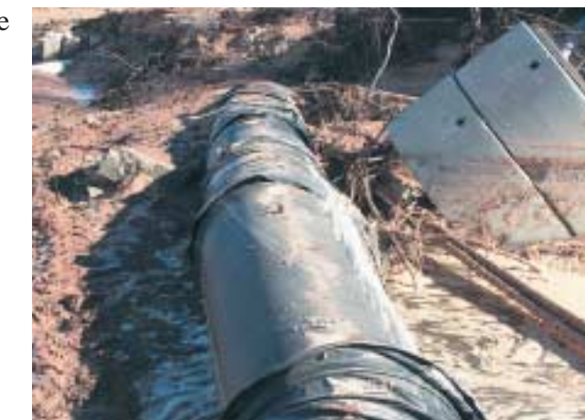
Regional Pipeline Exposed at Johnson Diversion

Since the upcoming two months of February and March traditionally bring the highest rate of precipitation to our area, we could be looking at a fairly significant water year. Rain has fallen on Washington County intermittently since the middle of October. Without the need to apply water to landscape, conservation percentages have been high. However, we cannot become complacent with the recent two and one half months of moisture. One plentiful water year will not offset a six-year drought.