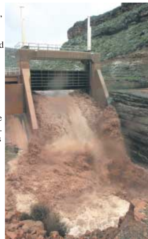
Virgin River at the Quail Creek Diversion