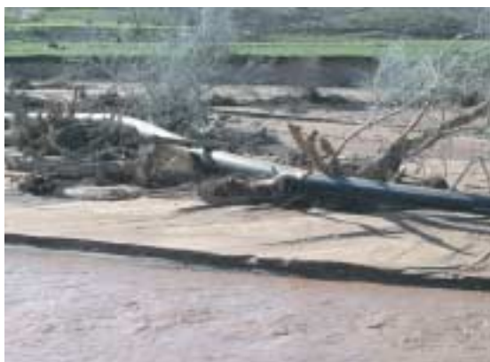
Santa Clara Pipeline