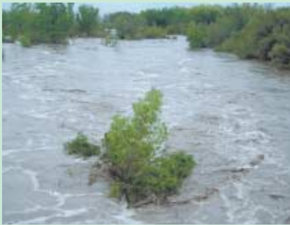
Virgin River by the Washington Fields Road Bridge

“Flood damage potential is greatly increasing as a result of development in the floodplain, urbanization and changes in the river,” explained Corey Cram, the local Watershed Coordinator.