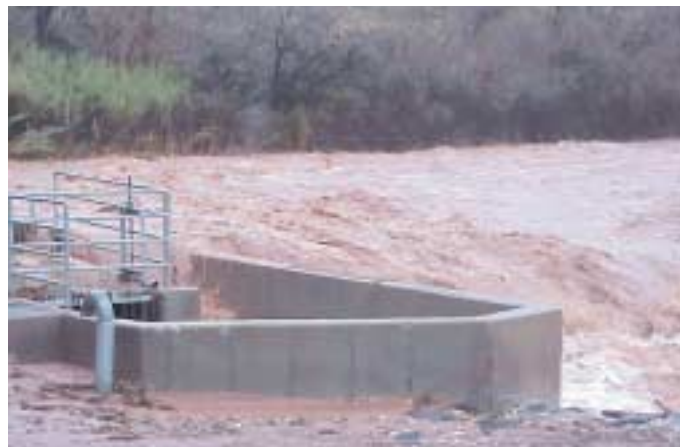
LaVerkin Creek Diversion

It is our hope that the spring snow melt will occur slowly. At this time, the saturated ground could not absorb major runoff and the rivers would most likely be inundated once again resulting in significant flooding.