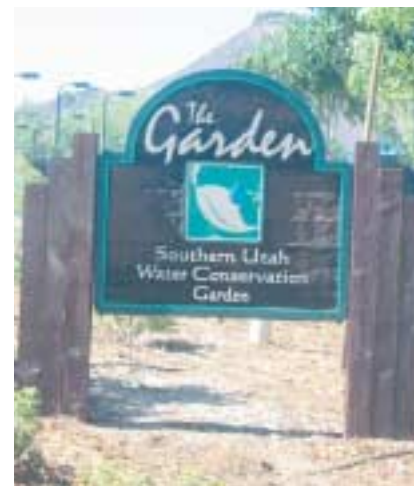
Demonstration Garden at the Tonaquint Nature Center

Find out why xeriscape is a natural choice in our arid, desert climate. Learn the benefits this landscape has to offer and the principles used in its design. This workshop will be held at the Tonaquint Nature Center at 1851 South Dixie Drive in St. George at 10 a.m. Space is limited so please call 673-3617 to reserve your spot. The cost for the workshop is $5 to be paid at the door.