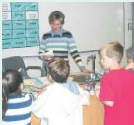
Working with children at the 2004 Annual Water Fair