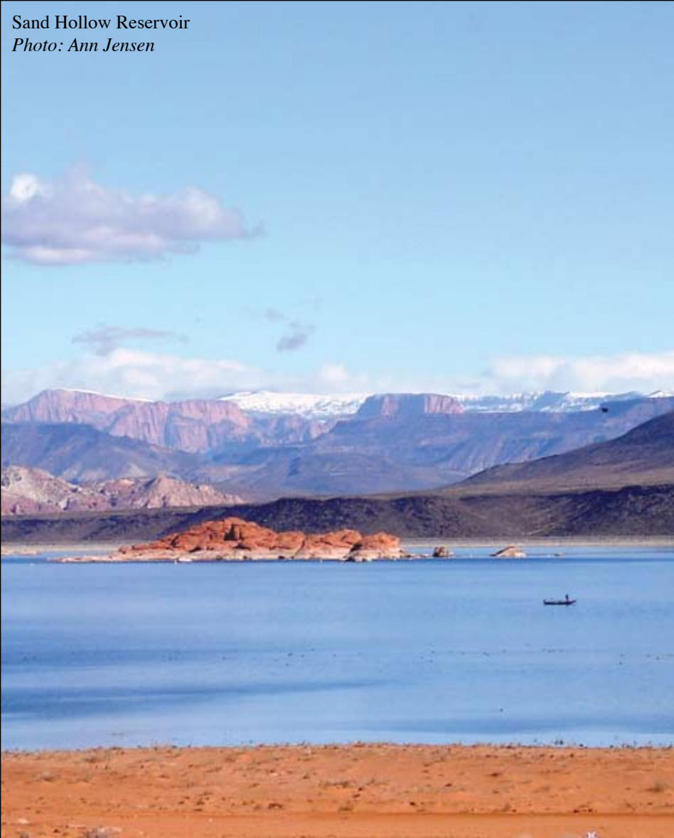
Sand Hollow Reservoir