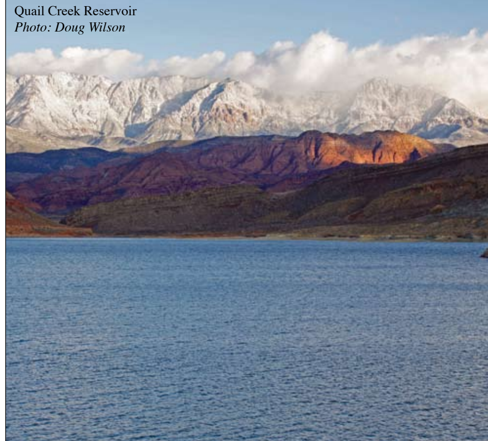
Quail Creek Reservoir

The last Board meeting of 2008 will take place at the District office at 136 North 100 East in St. George on Wednesday, December 10th, at 6:00 p.m. The public is encouraged to attend.